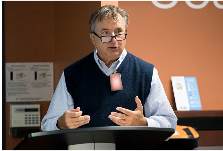
Author at the podium