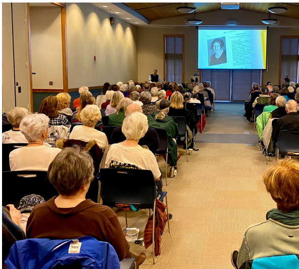
Transylvania County Library talk