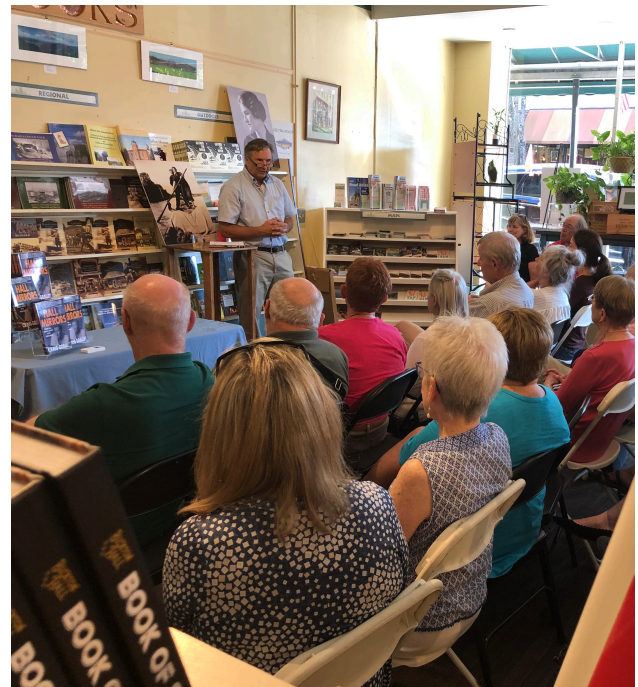
Highland Books talk